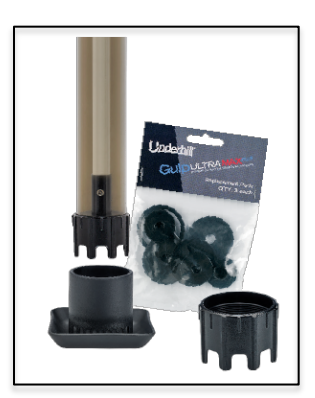
Gulp<sup>™</sup><sub>PRO</sub> Replacement Parts Figure 1-2

Thoroughly wash the inside of the hand pump cylinder, then wash both loosened ends. Replacement parts for the current are available, see Figure 2-2 below;