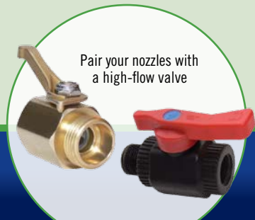
Pair your nozzles with a high-flow valve