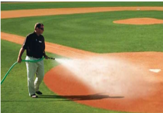
Solid metal construction allows Precision™ nozzles to maintain excellent distribution patterns for life. (Nozzle pictured with high-flow composite and stainless steel valve, sold separately)